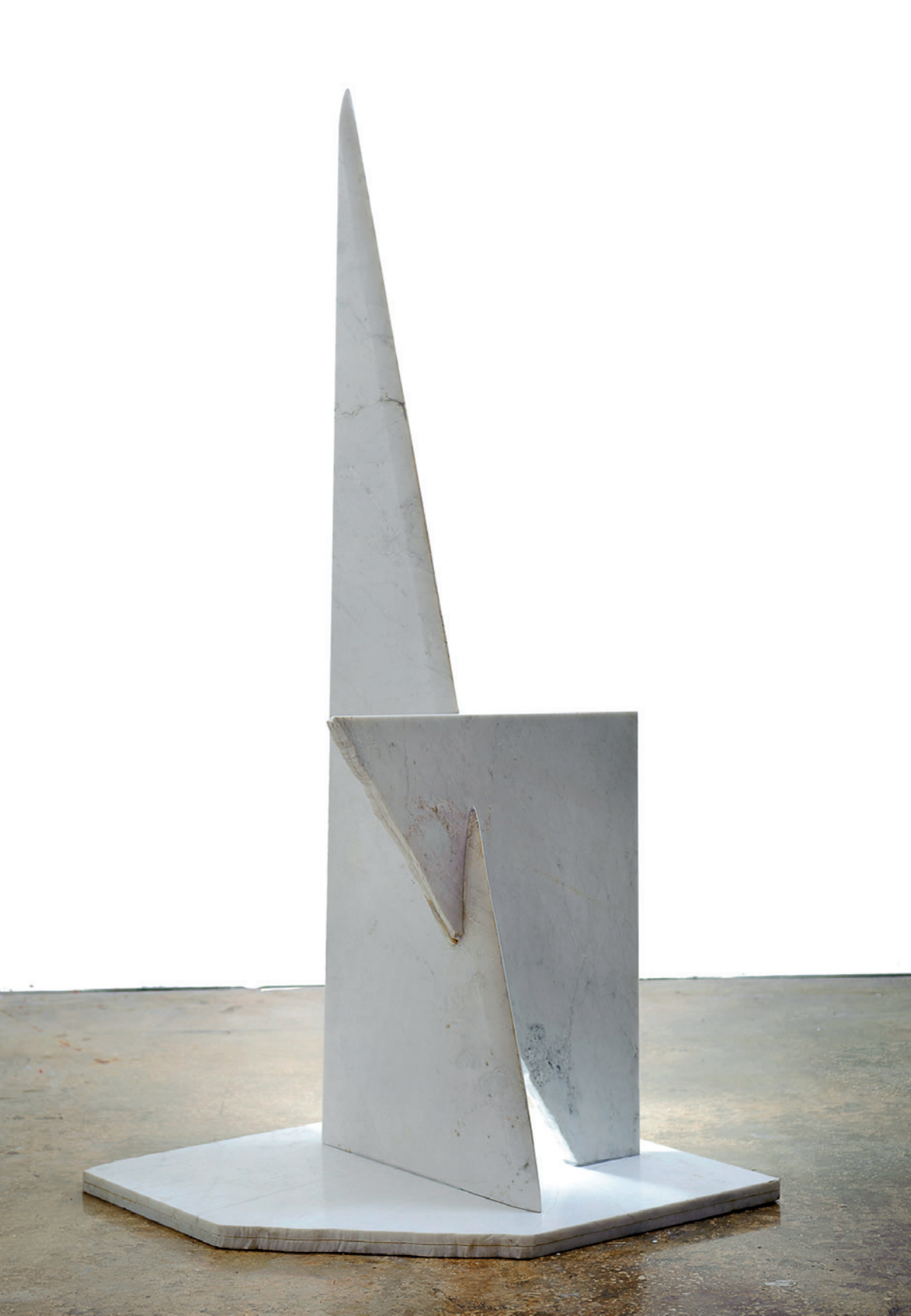
Displaced sculpture I White marble and resin 75" x 32.5" x 32" • 2018