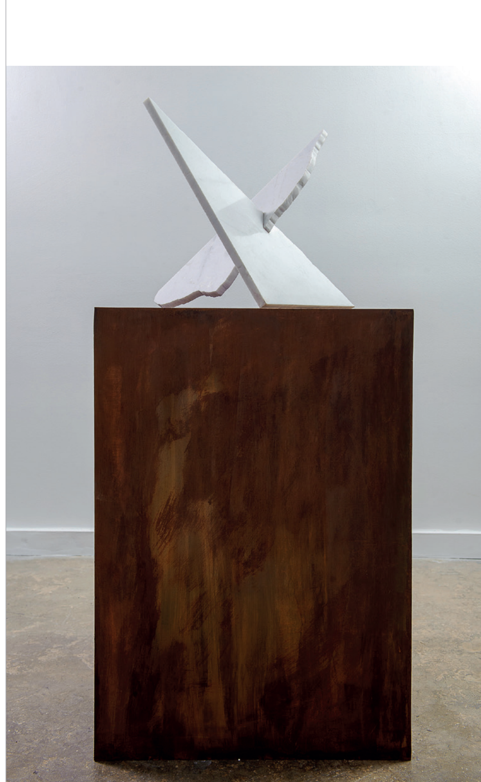
Displaced sculpture II White marble and metal structure with rusted patina 53" x 23.5" x 23.5" • 2018