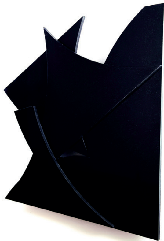
Displacement I Black granite, steel structure and resin 45.5" x 45.5" x 3.5" - 2018